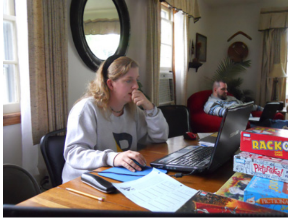
This is a typical "brain-storming" session at our house.

It's late at night when I'm writing this, and I have simply got to get to bed. My eyes are heavy... I'm falling asleep... Seriously, I'm breaking my "be-in-bed-by-ten-o'clock" rule. I didn't have time to finish like I wanted to, but I'll give you what I've got so far.